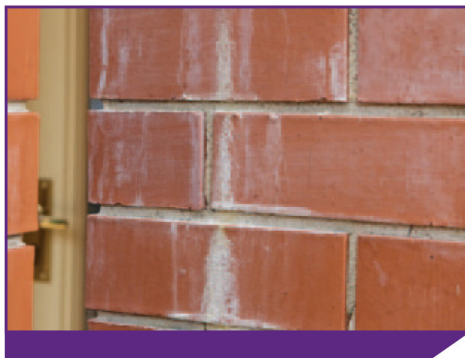
Calcium stains leaching from adjacent concrete balcony