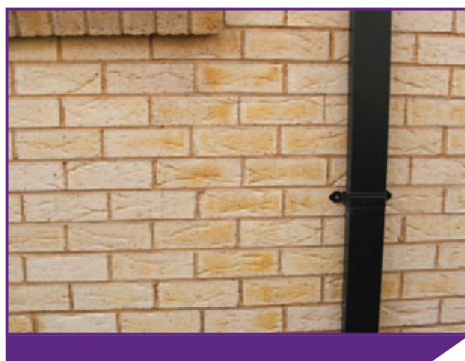
Acid burn on light coloured bricks