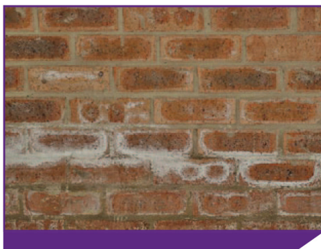
Efflorescence from ground salts