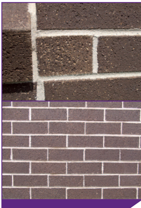
Damage to bricks caused by incorrect use of high pressure water jet cleaning