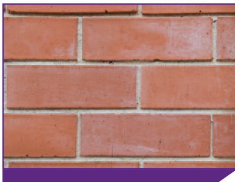
Typical calcium stain from wet sponging mortar joints