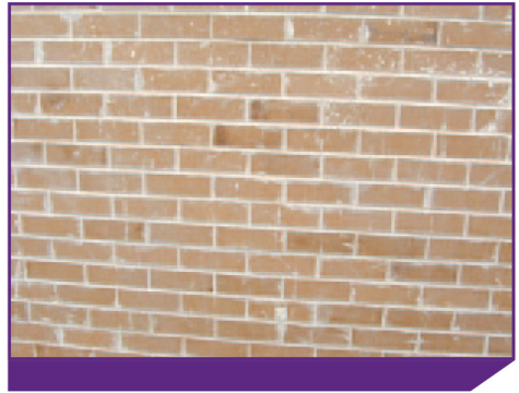
Typical wall after brick laying