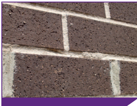
Damage to ironed mortar joint