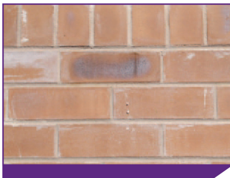
Signs of manganese staining